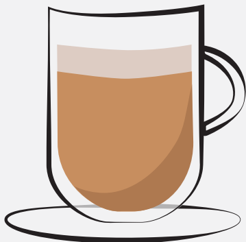
CHAI Spiced tea with milk