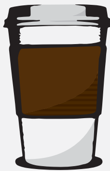
HOT CHOCOLATE Chocolate, milk (sometimes), hot water