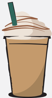
FRAPPUCCINO Ice, cream, flavored syrups