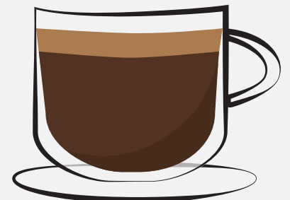
AMERICANO Espresso with hot water