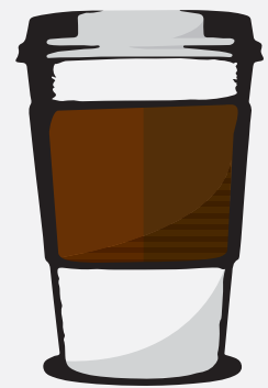
MOCHA Chocolate latte