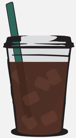
COLD BREW Cold water soaked coffee beans for a long time