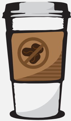
DECAF Coffee with no caffeine