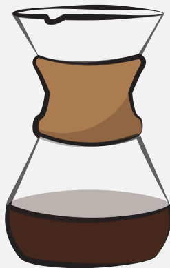
POUR OVER/DRIP Made by pouring hot water over the beans