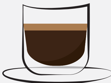
ESPRESSO SHOT/ DOUBLE ESPRESSO 1-2 oz of espresso grounds, hot water